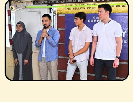
Mentorship.hk & Matchpreneur Should AI algorithms used in mentorship platforms prioritise diversity in mentormentee matching over the compatibility of skills and experiences?